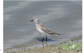
Semipalmated Sandpiper

If you are not a member of OrangeCountyBirding, we suggest you subscribe to get info online about birds & birding in the county. To subscribe: OrangeCountyBirding-subscribe@yahoo.com