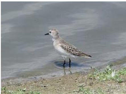
Semipalmated Sandpiper