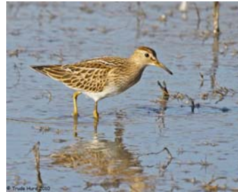
Pectoral Sandpiper

Cliff swallows, so abundant during summer near their mud nests on the Campus Drive bridge, have all but disappeared on their journey south.