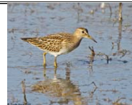
Pectoral Sandpiper

If you are not a member of OrangeCountyBirding, we suggest you subscribe to get info online about birds & birding in the county. Send email to: OrangeCountyBirding-subscribe@yahoogroups.com